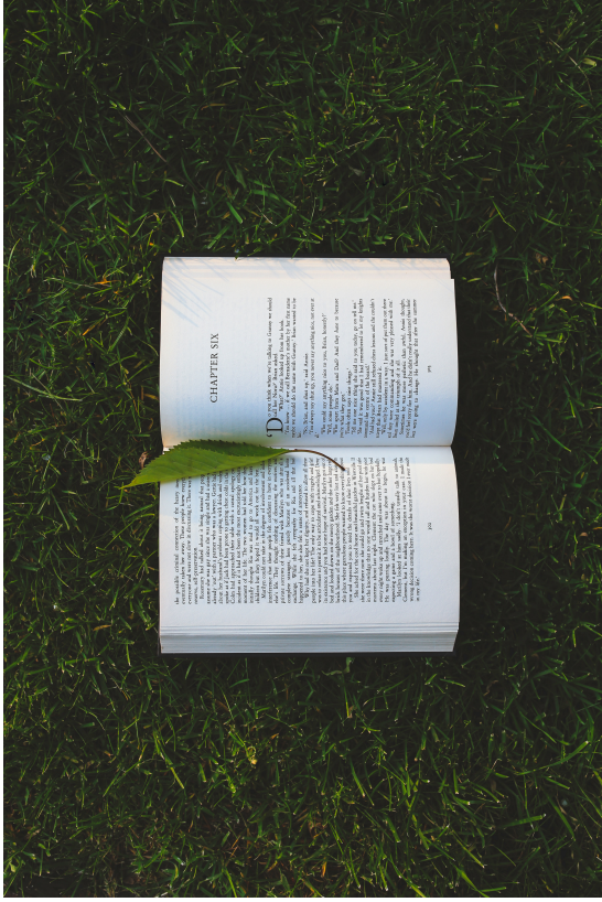
Figure 4.1:

! [chapter-six] (book-chapter-six-5834.jpg "")